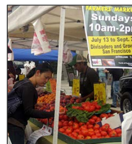
Divisadero Farmers' Market San Francisco, CA