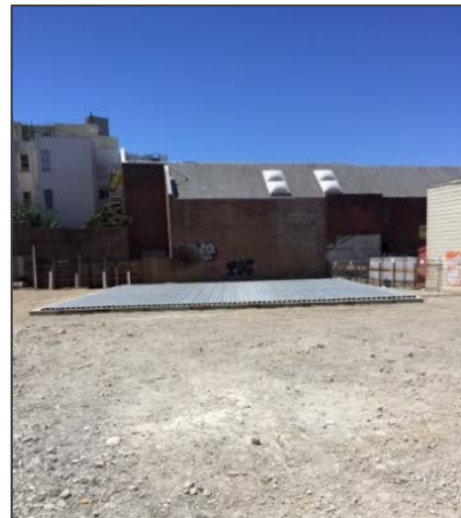
Pagoda Site Current Conditions

The owner of the Pagoda Palace site secured entitlements in 2009 to develop a five-story mixed-use project permitting 19 residential units above a 4,700 square foot restaurant. However, given the economic climate in 2009, the owner did not begin construction on the project.