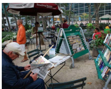
Pedestrian Plaza at Bryant Park New York City, NY