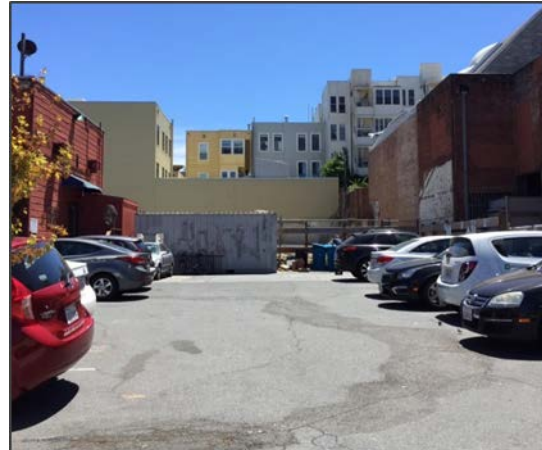
Piazza Pelligrini Parking Lot

Given the size of the site and the current open space in the parking lot, this option would impose less disruption in the streets and sidewalks than other options. However, temporary or permanent displacement of the Piazza Pelligrini restaurant is an issue that would need to be discussed in the public realm. Whether or not the restaurant needs to be removed would be further explored once the engineering requirements for the station are determined.