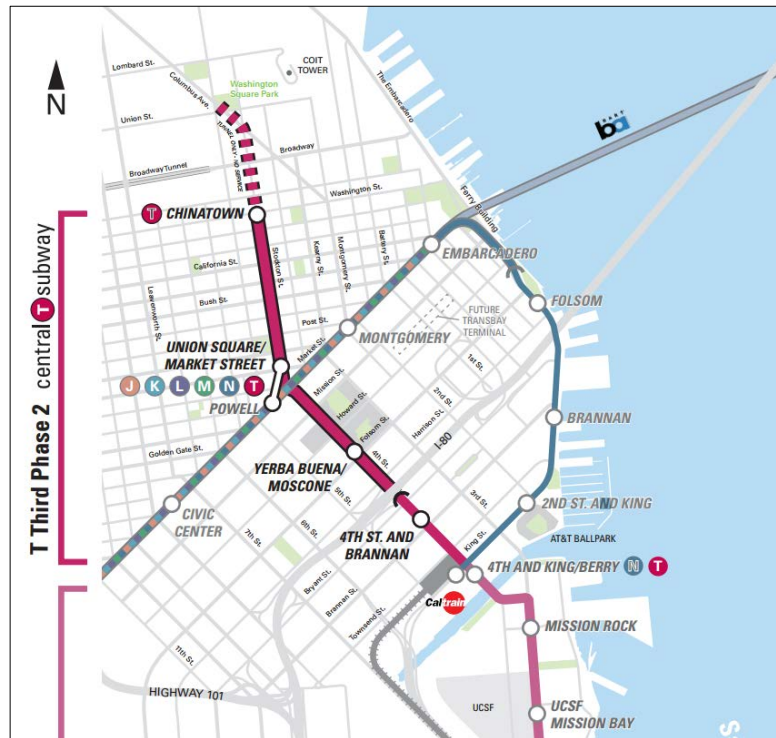
Exhibit 2: Central Subway Project Map