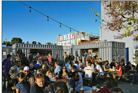
Exhibit 16: Proxy Development, Hayes Valley

permanent structures. It provides a public space for both residents and visitors to gather, while simultaneously offering casual dining options.