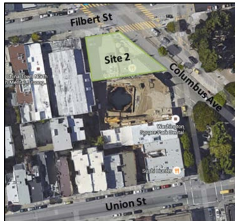
659 Columbus Ave Site Location