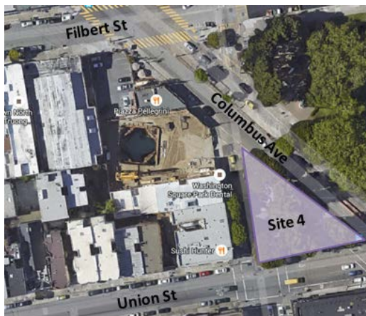
Park triangle site location