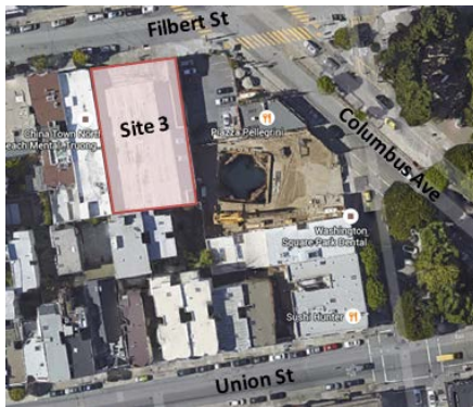
721 Filbert St Site Location