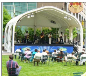
Pop-up Performance Venue Detroit, MI