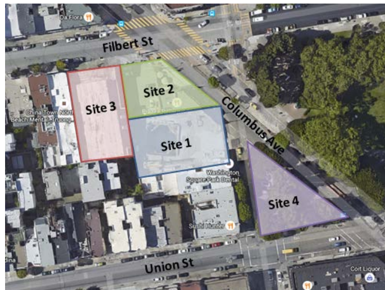
Exhibit 6: North Beach Station Site Options