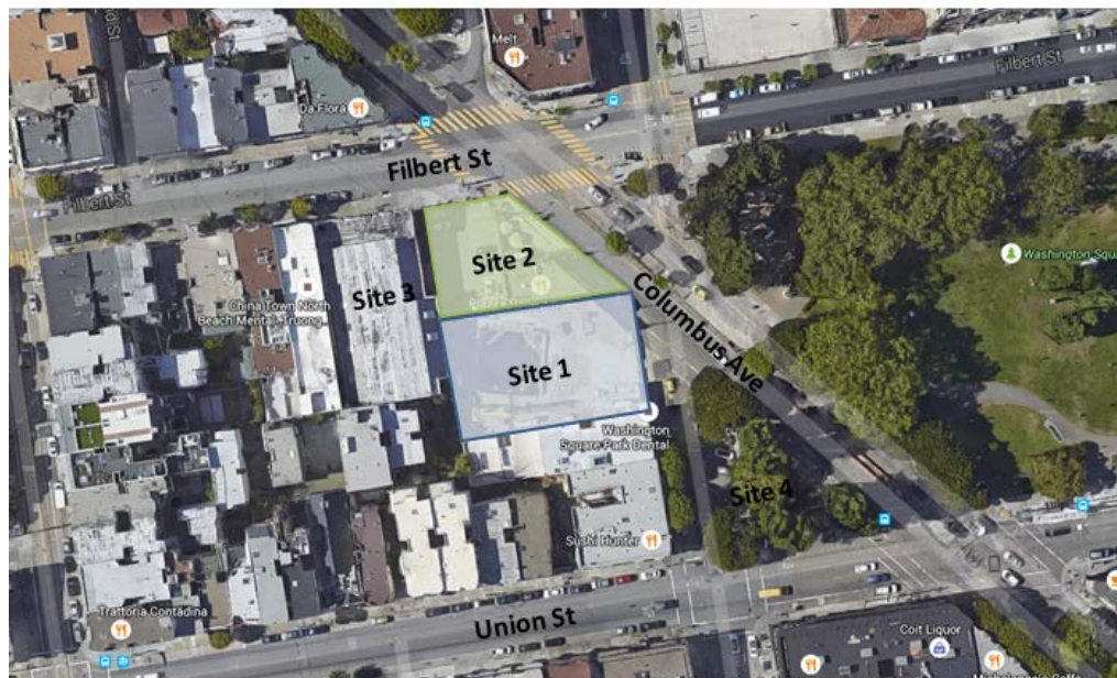
Exhibit 11: North Beach Station Site Options 1 & 2 Combined

Combining Site Options 1 and 2 would result in a large site of approximately 17,765 square feet. This larger site could potentially support substantially more space for a transit station, retail and residential units, than any of the smaller sites individually. However, the shadows cast on Washington Square Park would need to be considered for any tall development. Exhibit 11 below shows the two sites combined.