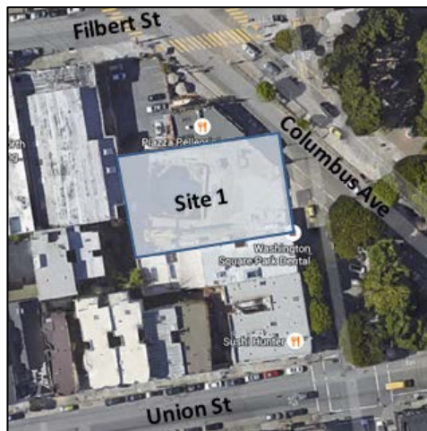
1731 Powell St Site Location