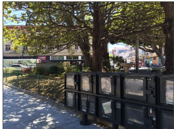
View of park triangle from Columbus Avenue

The advantage of using the small park is that there are no existing structures on the land, and no businesses would be affected. Any impacts to publicly-owned parks from a federally-funded project would be additionally subject to federal Section 4(f) 9 compliance, which in some cases can prevent a project from selecting