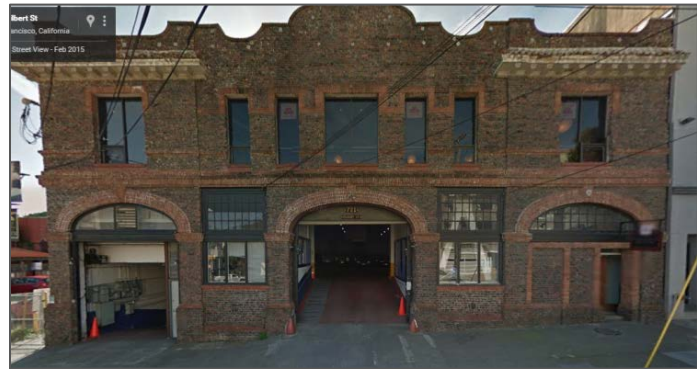
Front view of parking garage